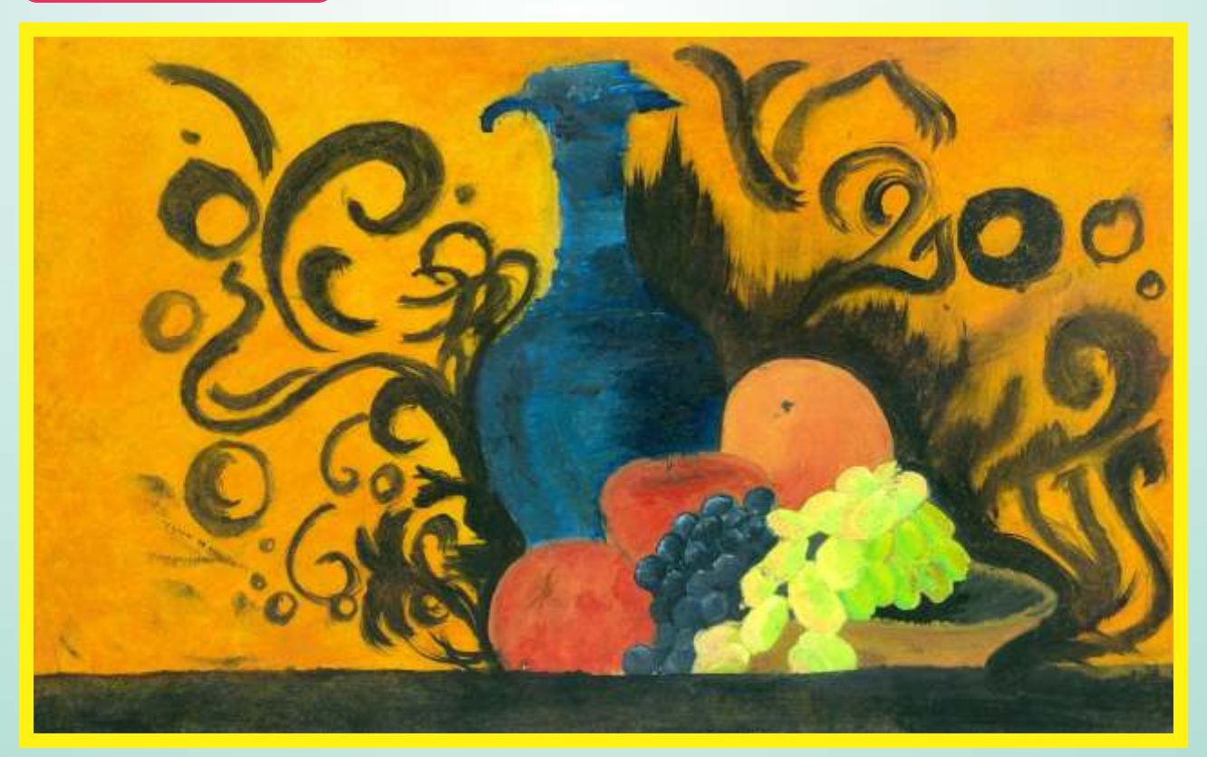
Art by - Namburi Lakshmi Sai Pravardhana - Mi.G.C - 2